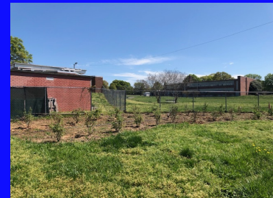
26 new blueberry bushes were planted in the field of the school.