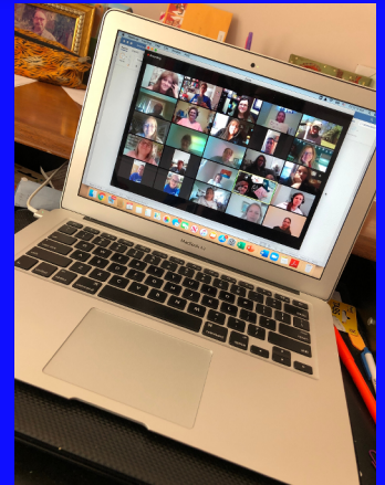
Webb Street staff meeting